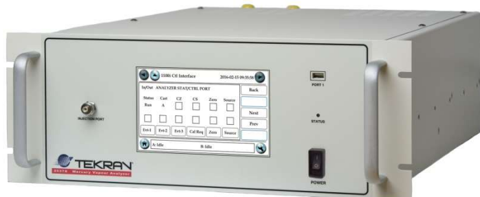
Tekran 2537X with 1115i Plugin