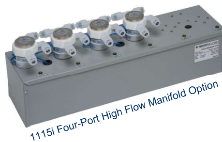
1115i Four-Port High Flow Manifold Option