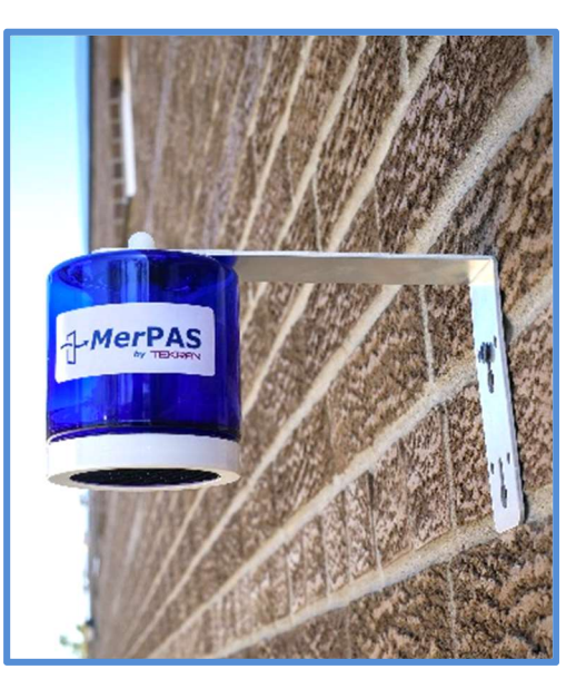
Deployed MerPAS sampler

MerPAS (Mercury Passive Air Sampler) is a major breakthrough for low cost mercury air monitoring. MerPAS is much more sensitive, precise, and accurate compared to any other passive mercury air sampler. The quality of Mer PAS has been repeatedly documented by scientists at the University of Toronto<sup>#</sup> who designed, developed, and tested the sampling Mer PAS technology and analysis method. is complementary resolution. to high electronic continuous air mercury monitoring by extending the spatial coverage at a reasonable cost. The Mer PAS device functions using a carbon-based trapping media housed inside a diffusive sleeve. The sampler is integrated into a container for easy deployment, collection, and shipping.